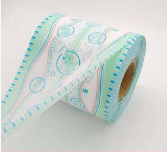
PE BREATHABLE FILM