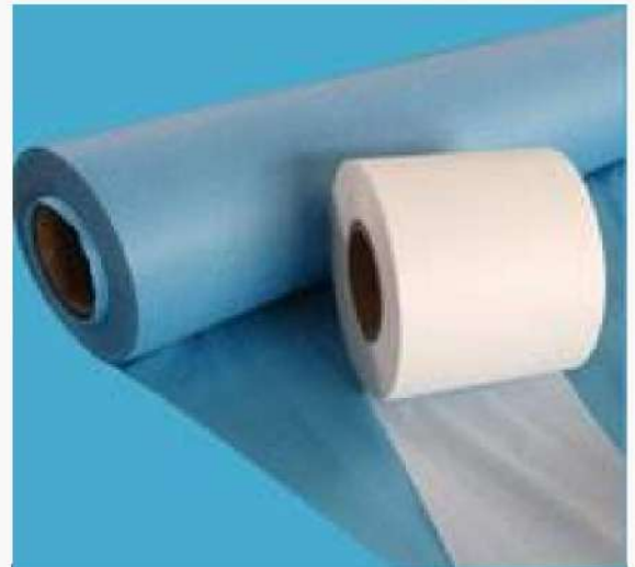
PE NON BREATHABLE FILM