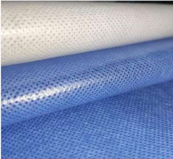
LEMINATED NON WOVEN