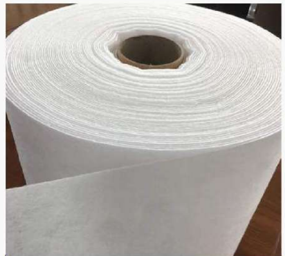
Hot air Cotton